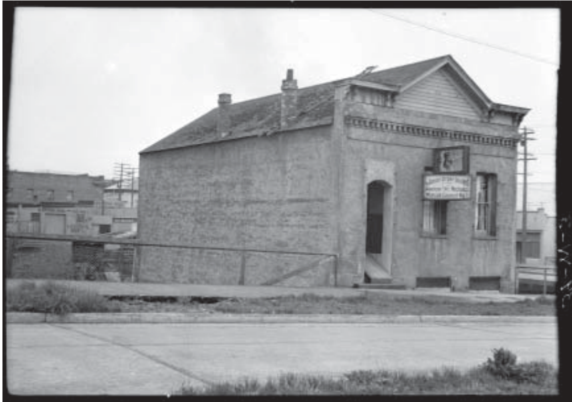
1934 Historic American Buildings Survey photograph. View of primary and northeast facades (Junior Order of United American Mechanics on primary facade).