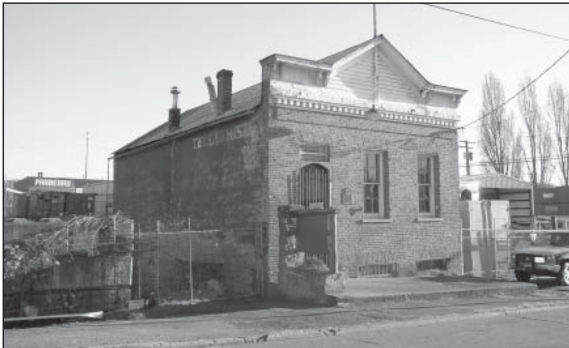
Current view of building taken February 16, 2005.